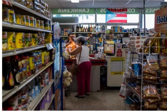
Food stamp beneficiaries doing their groceries shopping at Agranel Supermarket in Manati, Puerto Rico.

The Dietary Guidelines are currently being developed. You can get involved by reviewing this website regularly for updates, attending or viewing recordings of public meetings, and providing comments.